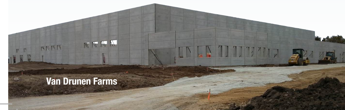
Van Drunen Farms

This piece is intended for promotional purposes. For the most accurate and current information regarding the eligibility of your property or development for Enterprise Zone incentives in Kankakee County, please contact the Enterprise Zone administrators listed herein.